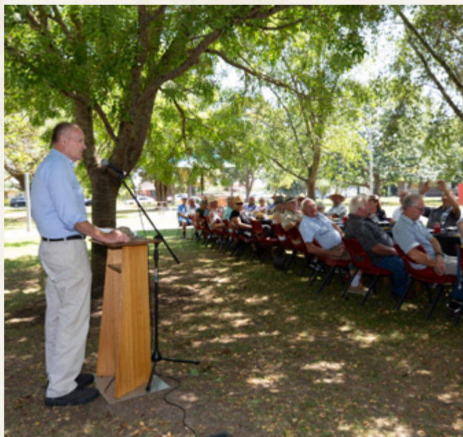
Old Scholar (Class of 1973) and former Federal MP for Melbourne Lindsay Tanner was the keynote speaker at the 'Gippsland Grammar School' reunion BBQ.