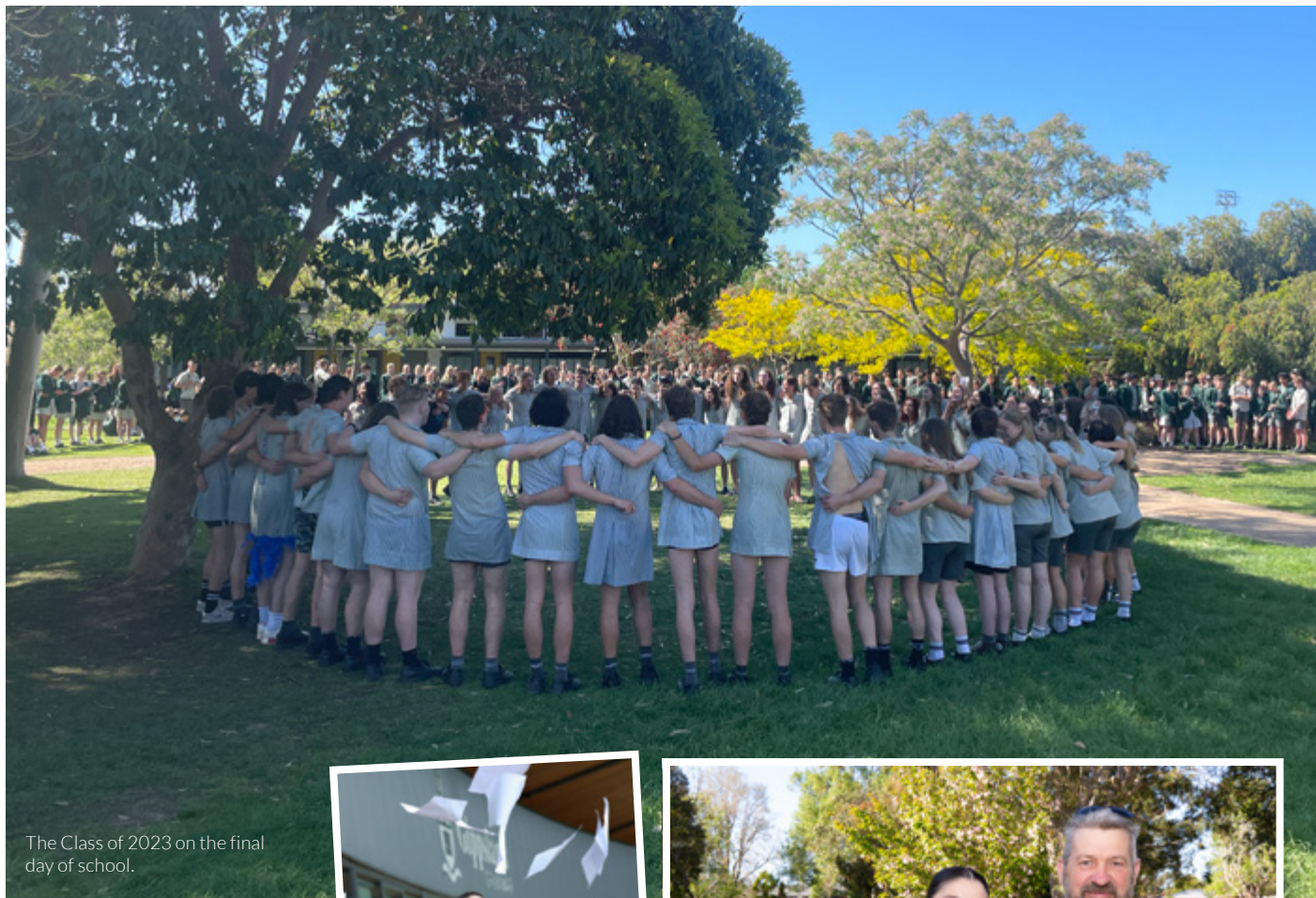
The Class of 2023 on the final day of school.