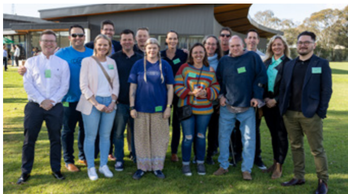
Old Scholars from the Class of 1993.