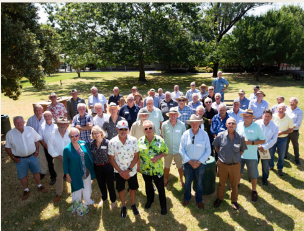
The 'Old Boys' from Gippsland Grammar School at the reunion BBQ.