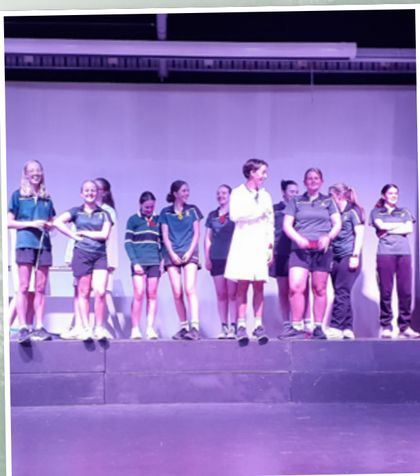
Rehearsals are in full swing for 'Catch Me If you Can', the Garnsey production on stage in the Garnsey Hall for four shows from April 18-20. Book here: trybooking.com/COATP