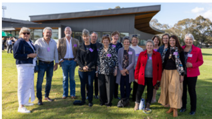
Old Scholars from the Class of 1973.

The Decades Reunion for the classes of 1963, 1973, 1983, 1993, 2003 and 2013 was held in October last year with almost 100 students from across the cohorts reconnecting, reminiscing and mingling.