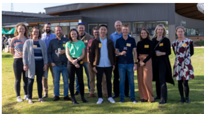
Old Scholars from the Class of 2003.