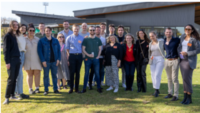
Old Scholars from the Class of 2003.