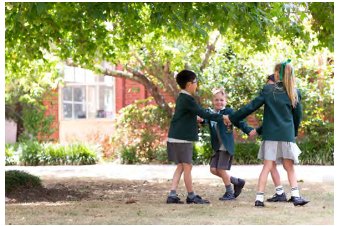
Students play under the St Anne's oak tree.