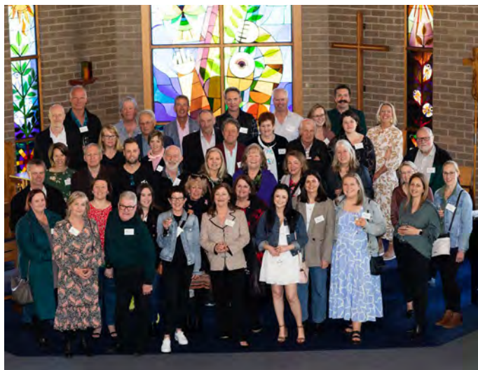
More than 40 Old Scholars attended last year's 'Decades Reunion' in October.

And in January, our 'inaugural' summer drinks reunion was held at the Metung Hotel and was a huge success with about 15 Old Scholars reminiscing by the water. Next year's Summer Drinks will be held on the afternoon Saturday January 13. More details to come.