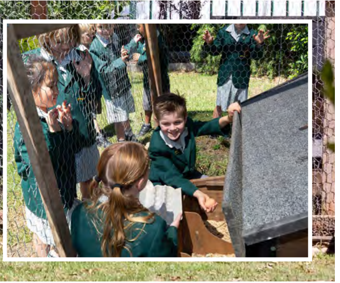
Bairnsdale students sell eggs from the campus chooks to help pay for the chooks' upkeep.