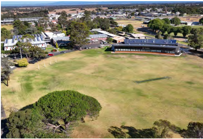
The Garnsey Campus is dominated by an expanse of lush sporting ovals.