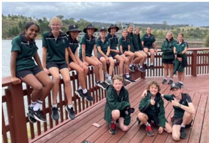
Year 7 Geography students visit Lake Glenmaggie to identify human impact on local waterways.