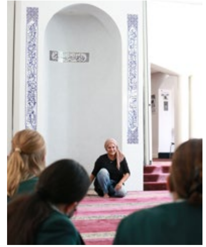
Students visit a mosque in Carlton.