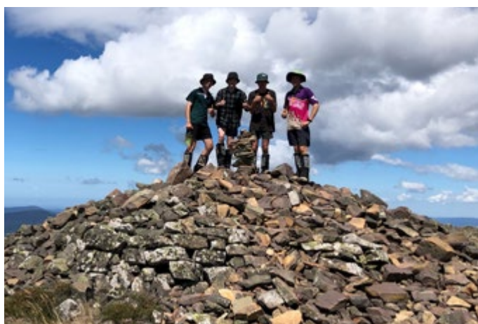
Year 9 students on a four-day bushwalk into Lake Tali Karng in the Alpine National Park.