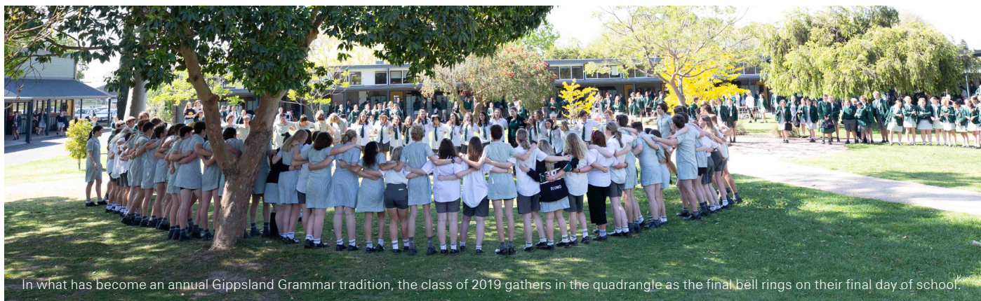
In what has become an annual Gippsland Grammar tradition, the class of 2019 gathers in the quadrangle as the final bell rings on their final day of school.

Gippsland Grammar was thrilled to celebrate another outstanding year of VCE results with its class of 2019 among some of Victoria's highest achieving Year 12 students.