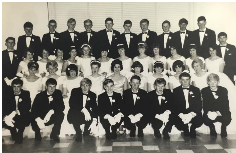
Photo: 1966 Debutante Ball