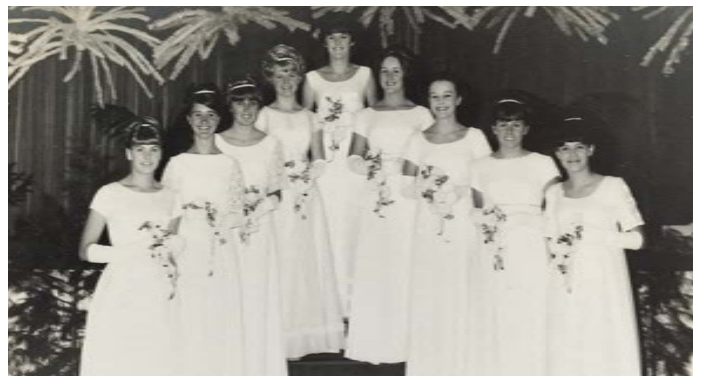
1967 Debutante Ball