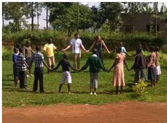
Photo: Games and singing in Gahini