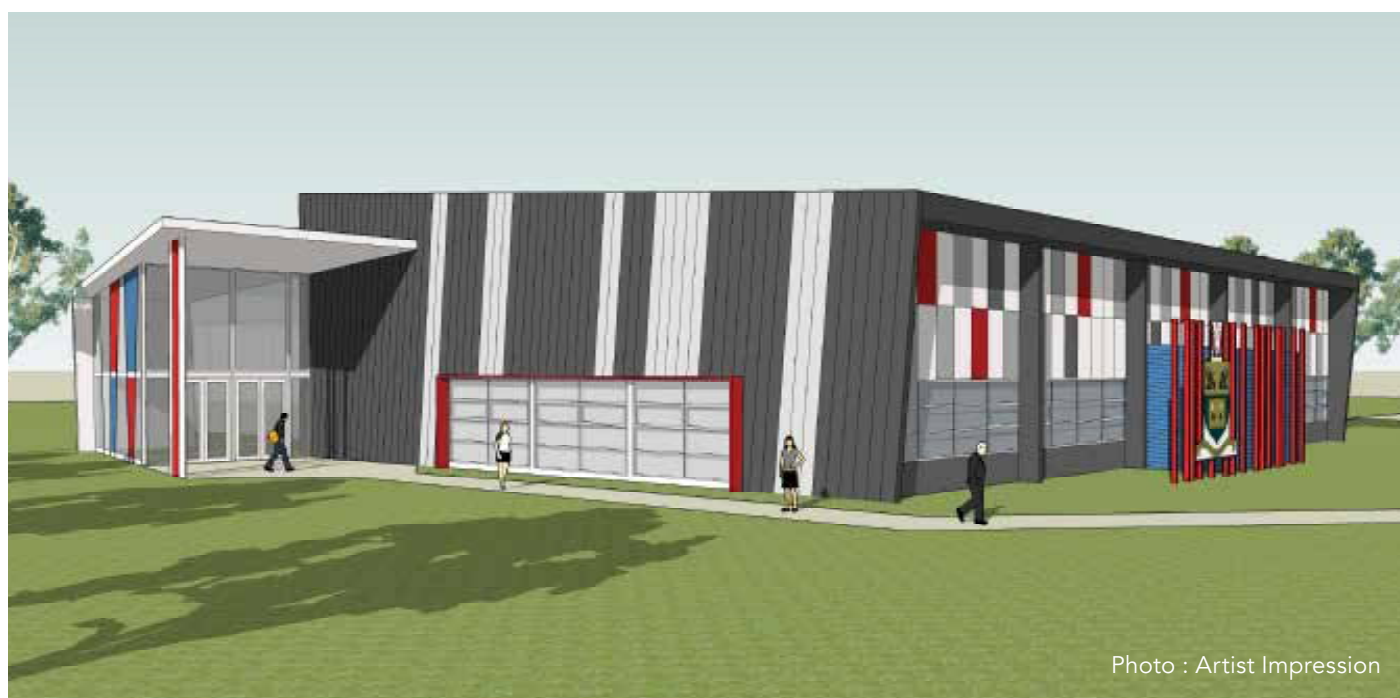
Photo : Artist Impression