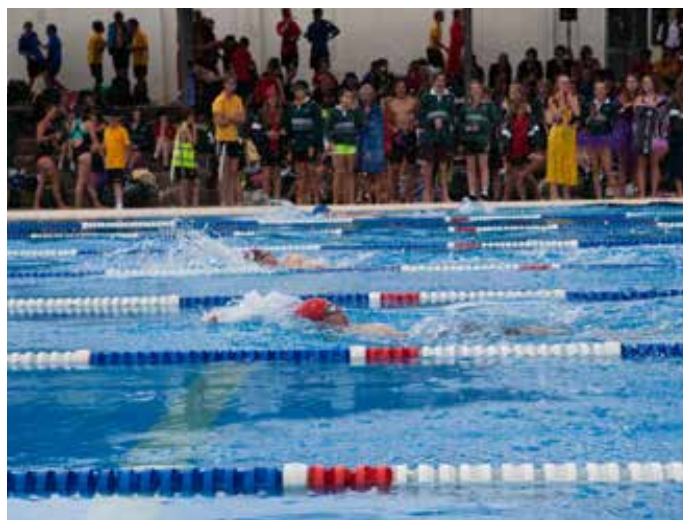
Photo: Racing at the Garnsey Campus House Swimming Carnival

Students at our Bairnsdale Campus enjoyed glorious weather for their House Swimming Carnival on Friday 13 February. The students swam and cheered each other on and showed great spirit through their performance in and out of the pool. It was great to see everyone try their hardest and be proud of their efforts. Again, there was wonderful support from our staff and parents and we thank everyone for contributing their time and helping to make the day a success. The results were: 1st - Cranswick Dargo, 2nd - Blundell Bogong, 3rd - Tisdall Hotham, 4th - Wellington Binks.