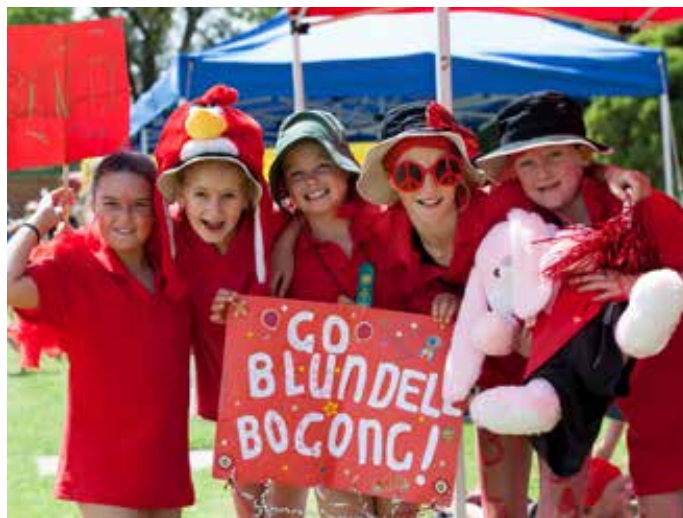
Photo: House spirit at the Bairnsdale Swimming Carnival