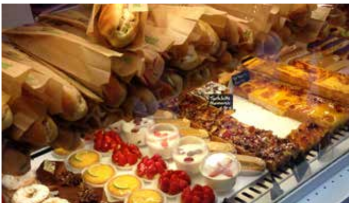
Photo: Pâtisserie treats