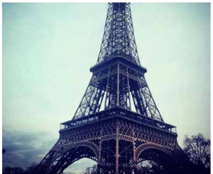
Photo: The Eiffel Tower