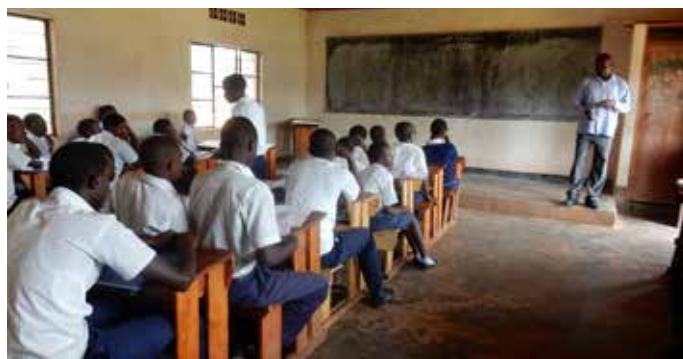
Photo : A History Class