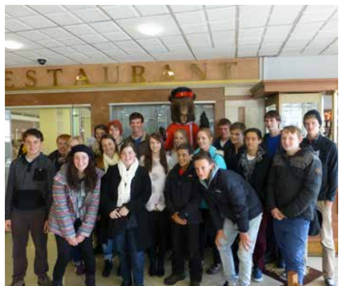
Photo : Tour group.