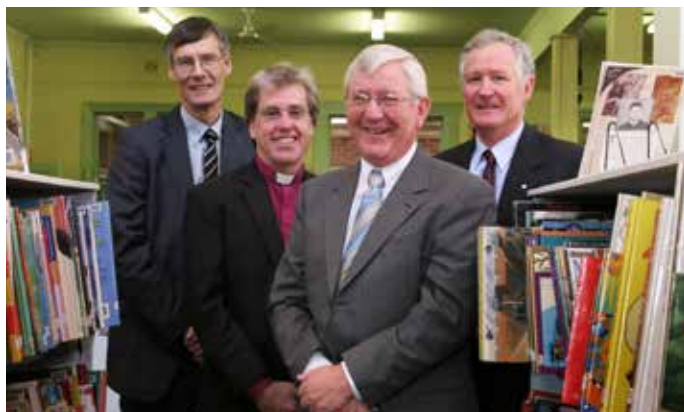
The opening of the Library Refurbishment at St Anne's Campus in 2008.