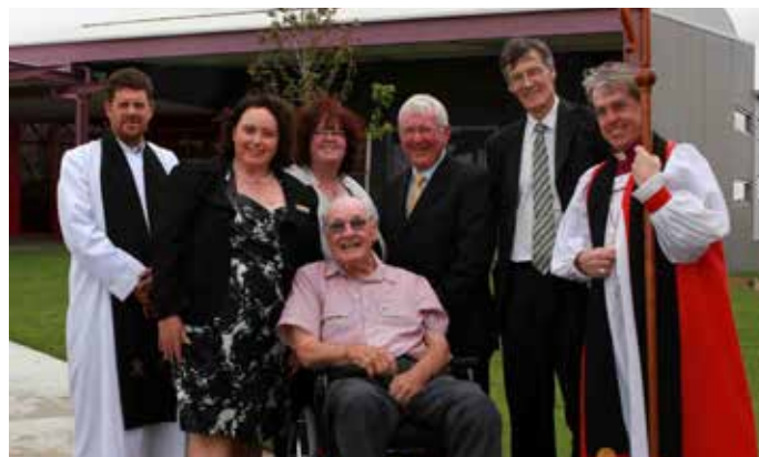
The opening of the James Beard Centre at Bairnsdale Campus in 2011.