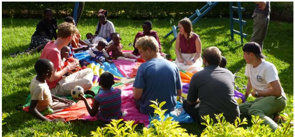
Photo: Playing with children at the rehabilitation centre.

There is a special relationship between the Anglican Diocese of Gippsland and the Anglican Diocese of Gahini. This friendship provides the unique opportunity for our 'Schoolies' to enjoy a unique adventure, which offers challenges and community service. Everyone had an amazing time, taking inspiration from some of the happiest people they have ever met.