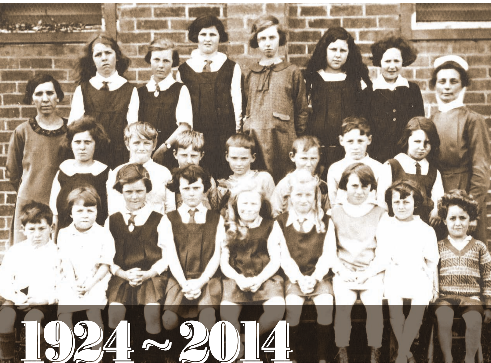
Above: Church of England Girls' School Sale (circa 1926)