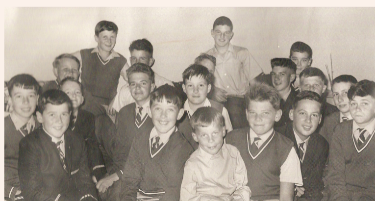
1962 - Gippsland Grammar School Boarders