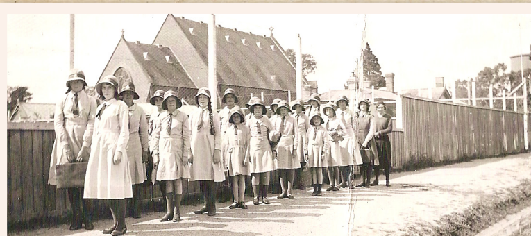
1930s - Church of England Girls' School students