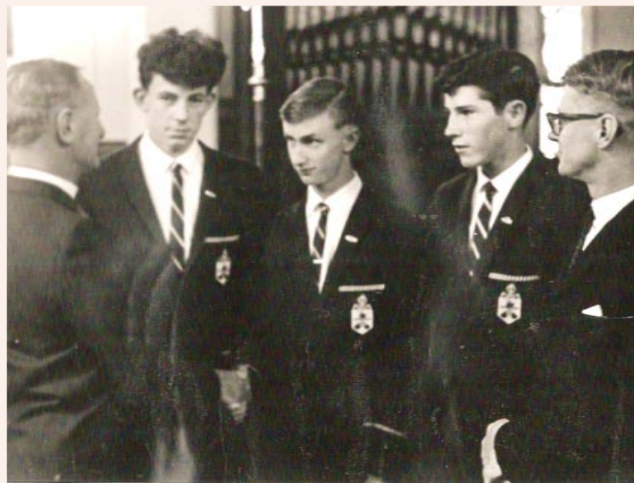
1965 - School Prefect Induction at St Paul's Cathedral, Sale