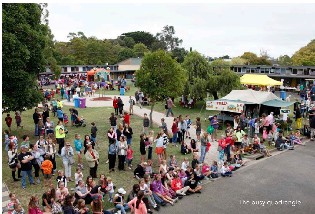
The busy quadrangle.