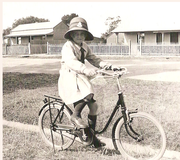
Junior student – 1930s