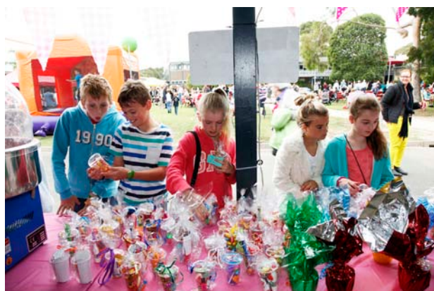
Left: The Lucky Cups Stall.