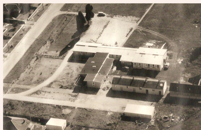
1965 - Aerial view of Garnsey Campus