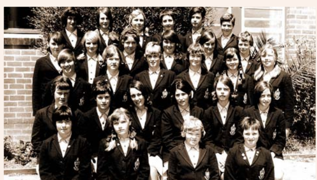
1967 – Form VB1 - St Anne's CEGGS