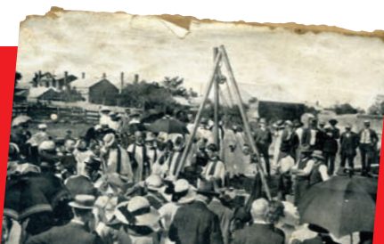
School History Page 12