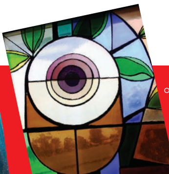
20 Years of Chapel Page 7