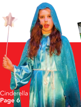
Cinderella Page 6