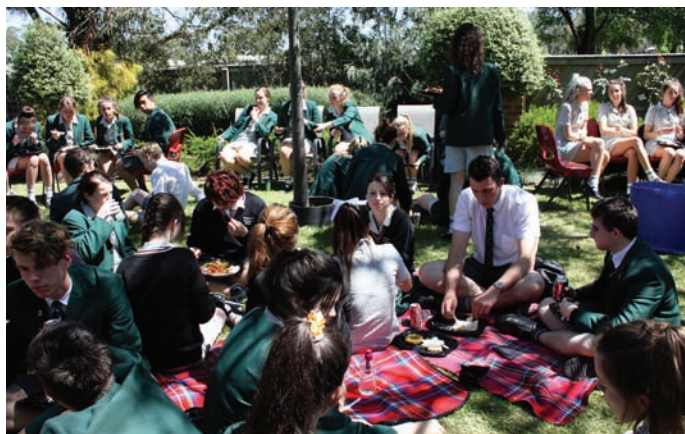
Photo: Year 12 students enjoyed a farewell BBQ in October.