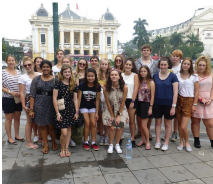
Photo: Visiting Ho Chi Minh City.

On the last day of Term one, eighteen students and three teachers set off for Melbourne Airport, headed for Vietnam. This year, the trip was arranged earlier, in an effort to avoid the hot July weather and to see Ho Chi Minh in his mausoleum, which is closed in September. Highlights were a Sapa trek across steep and often slippery terrain, a homestay, a bay cruise, kayaking through a floating village and spending time in Hanoi. A long overnight train trip took the group to Hue for a short visit to the famed citadel, and then they set off by bus to Hoi An, always a highlight of any trip to Vietnam. In Hoi An, the students rode bicycles along quiet lanes, had clothes tailor made, attended cooking school and enjoyed a river cruise and the sights, sounds and smells of the ancient city. A short flight to Ho Chi Minh City was followed by a city tour, shopping at a busy night market and a trip to the Mekong Delta, where the group saw the floating markets and visited some local businesses. Special thanks are extended to the wonderful staff that accompanied the students and made this a memorable experience for all.