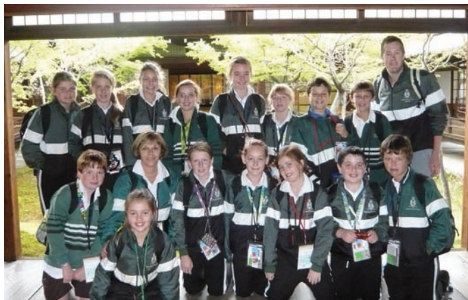
Photo: Year 5 and 6 students visited the Kenningji Temple in Kyoto.