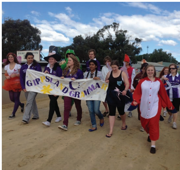
Photo: Year 11s during the Relay For Life event at the Sale Greyhound complex.

Both teams enjoyed supporting the Relay For Life for the Cancer Council and we are very proud of their efforts.