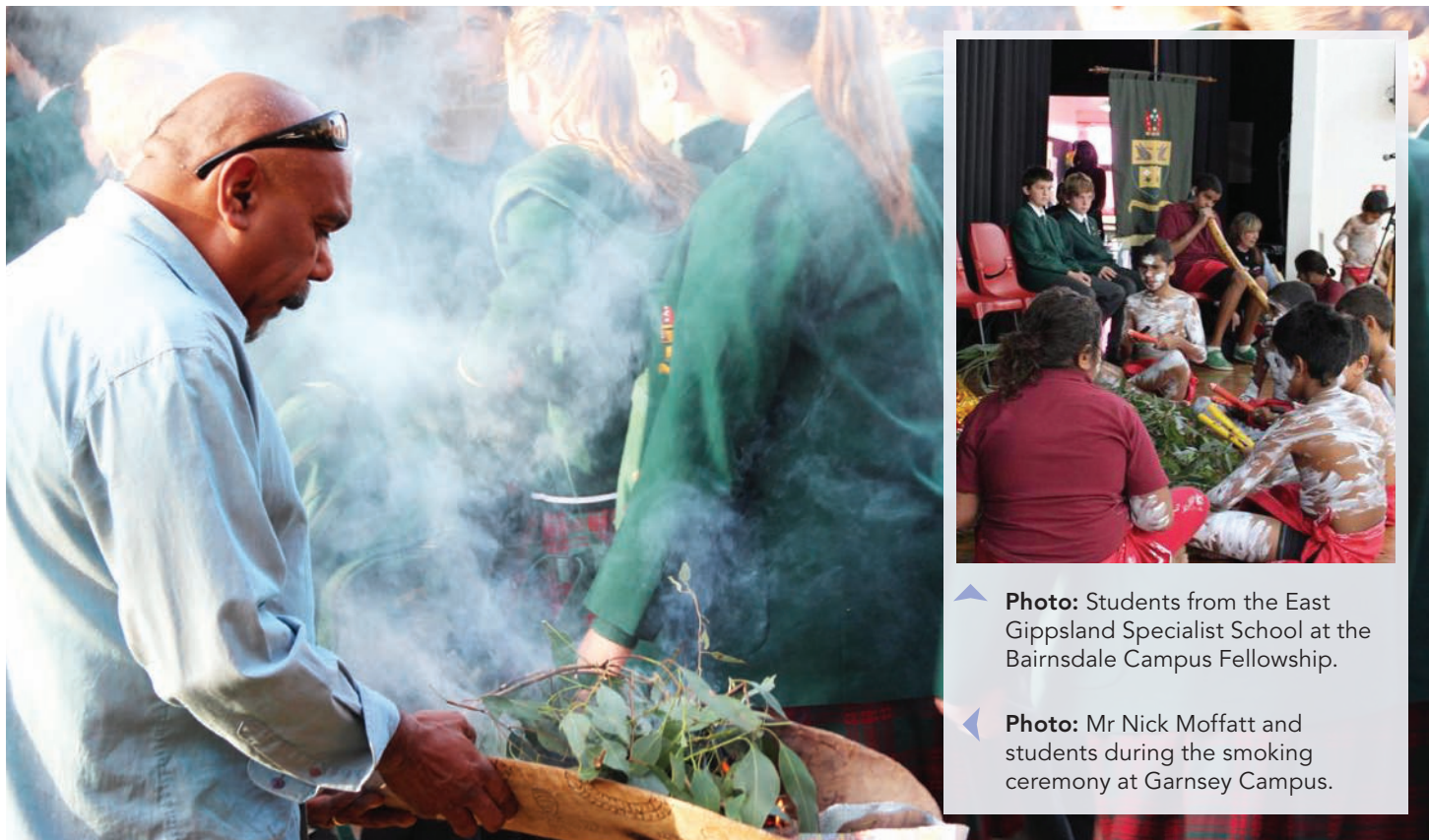
Photo: Students from the East Gippsland Specialist School at the Bairnsdale Campus Fellowship.

This year, there were many opportunities to explore and reflect on what reconciliation means at Gippsland Grammar. We thank all of those members of our community who were involved in the various activities at the Bairnsdale, St Anne's and Garnsey Campuses. All of these activities further strengthen our relationships with the aboriginal communities in the Gippsland area.