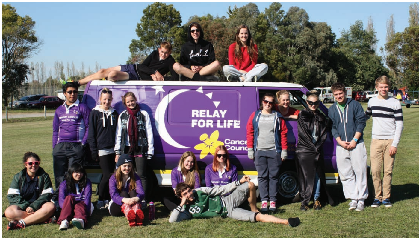
Photo: Year 12s at the South Gippsland Relay For Life event at Dumbalk.

Relay For Life began in Australia in 1999 and is now run in every state and territory and raises over $14 million each year for the fight against cancer. This year, students from the School supported Relay for Life at two events in Gippsland.