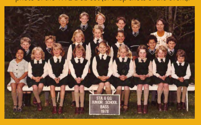
1978 Bass Photo – thirty years on Can you help us name the faces in this photo from 1978?

The School Archivist is seeking a group photo of the 1972 Deb set (or snap shots of the event).