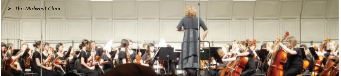
> The Midwest Clinic