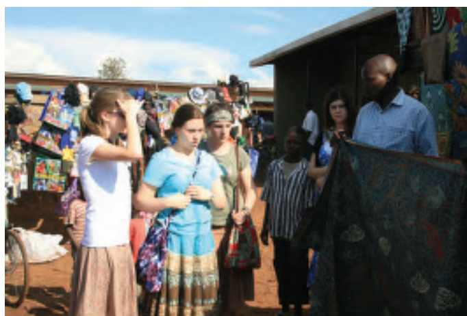
> Above: A local market place.

"After lunch, we took a taxi bus to Kayunza to explore the markets. It was really fun; we had a group of kids follow us around the market. When we got home, we went for a swim and a kayak down at the lake – very peaceful!"