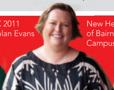
New Head of Bairnsdale Campus P6