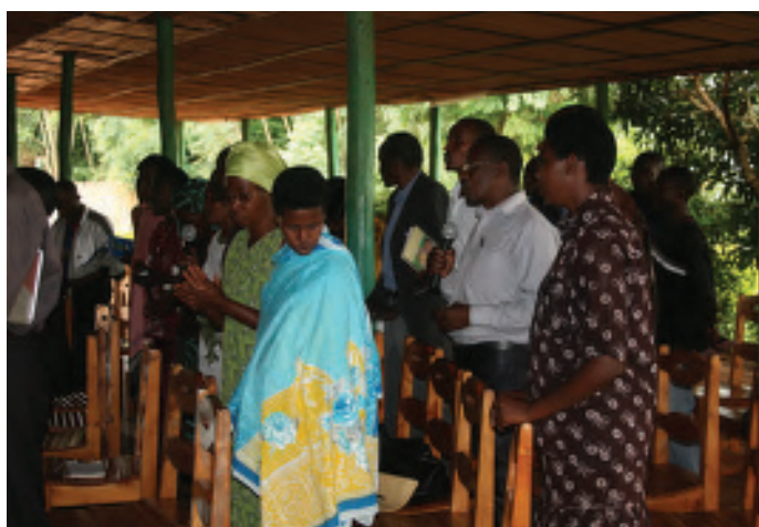
> Above: A community celebration.

"The poverty was more evident in the car ride, as you see children no older than 6 carrying jerry cans, bananas or tending to crops. It makes me never want to say no to mum's request to empty the dishwasher ever again!"