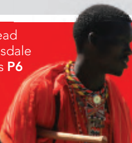
Rwandan Experience P8