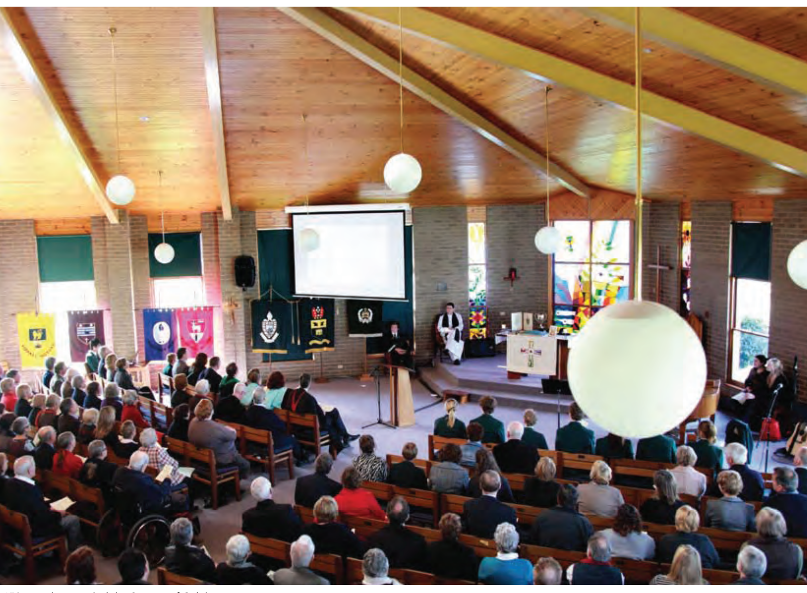
150 people attended the Service of Celebration.