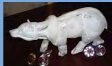
> Above: 'Polar Bear' by Crystal Stubbs (1997).

the School in its aim to provide up to date facilities for the benefit of all students. We look forward to our next fundraising function in 2011.