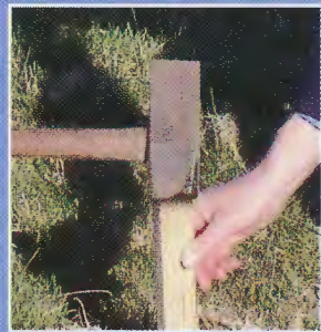
Bairnsdale commences Page 4