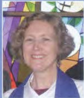
New Chaplain welcomed Page 3