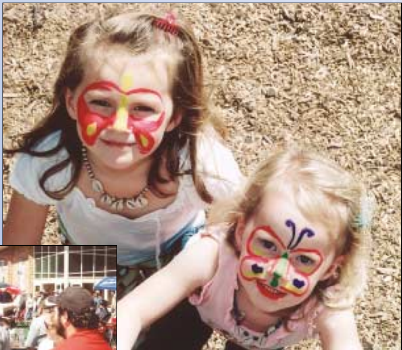
More STAGGfair photographs on page four

The pictures tell the story of another great success.