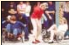
'GEAR UP' program